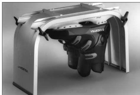
Item 7130 Aluminium Sharpening Jig – High

These aluminium sharpening jigs are made out of one piece of special extruded profile. The jigs are stable. The precision spacers have a so-called _ fast locking system. The jigs are natural anodized.