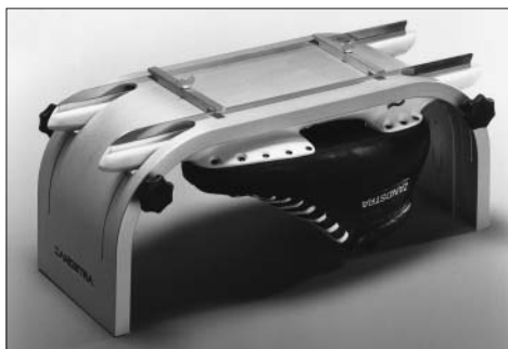
Item 7135 Aluminium Sharpening Jig – Standard

This jig is 10 cm higher than a standard jig. Also suitable for short track skates.