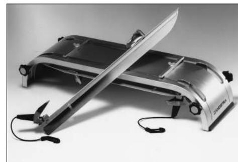
Item 7139 Aluminium Sharpening Jig – Low

This is suitable for all speed blades with leather boots.